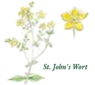
St. John's Wort