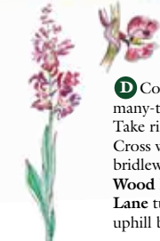
Early Purple Orchid

D Continue ahead to large, many-trunked beech tree. Take right fork to Gangers Hill. Cross with care and follow bridleway ahead past Hanging Wood Farm. At Tandridge Hill Lane turn left and follow path uphill beside road.