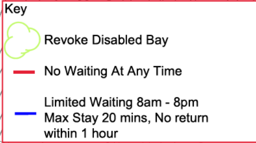
Drawing 21 - Various Roads, Shere