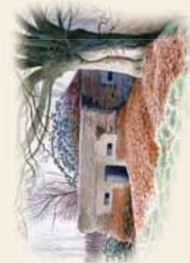
WWII pillboxes held the line against invasion

1 Turn left as you leave the pub and walk along Langshott for around 200 metres until you come to a crossing of the Surrey Cycleway, turn left to head up Lake Lane and begin your journey through time.