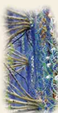
Copse woodlands offer a wonderful spectacle of bluebell and wood anemones in Spring

14 The road eventually leads you back to Lake Lane, and back along Langshott to The Farmhouse Pub where your journey began.