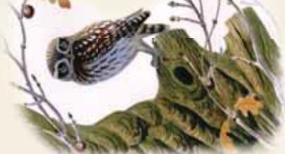
Little Owls become active when dusk falls, hunting for beetles, worms and small mammals.

5 Now just across the field you can see a metal handled bridge at the base of a large Ash tree and the Burstow Stream to your right. Walk to, but