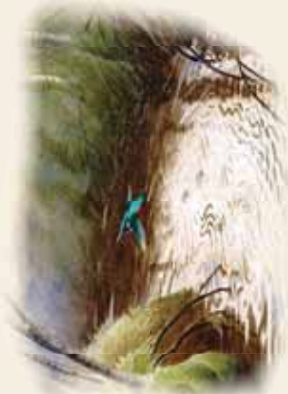
Kingfisher, a speeding streak of brilliant blue

9 When you reach Haroldlea Drive, stop a moment and consider that this may have been the very path taken by King Harold on his way to the Battle of Hastings. It is rumoured that