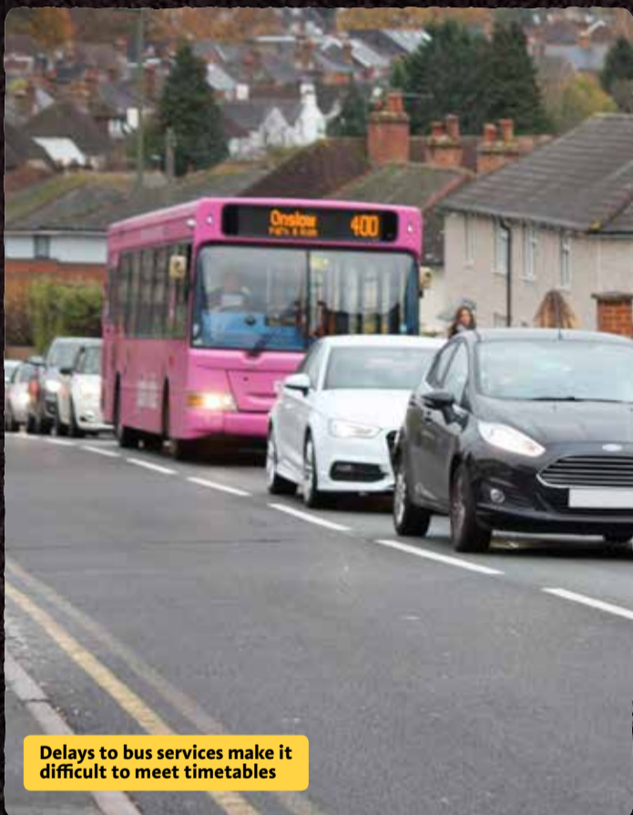
Delays to bus services make it difficult to meet timetables

Buses are a vital mode of transport for the local area, carrying roughly five million passengers per year and connecting neighbouring towns and villages with Guildford. Every day 15,000 people travel on buses in Guildford, and these numbers are increasing each year.