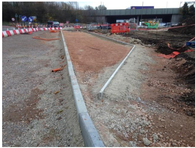
The pictures above show the new U turn facility and the new service vehicle bay on the north side of the roundabout.