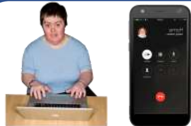
On the internet or the phone.