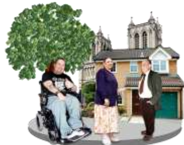
In your community.