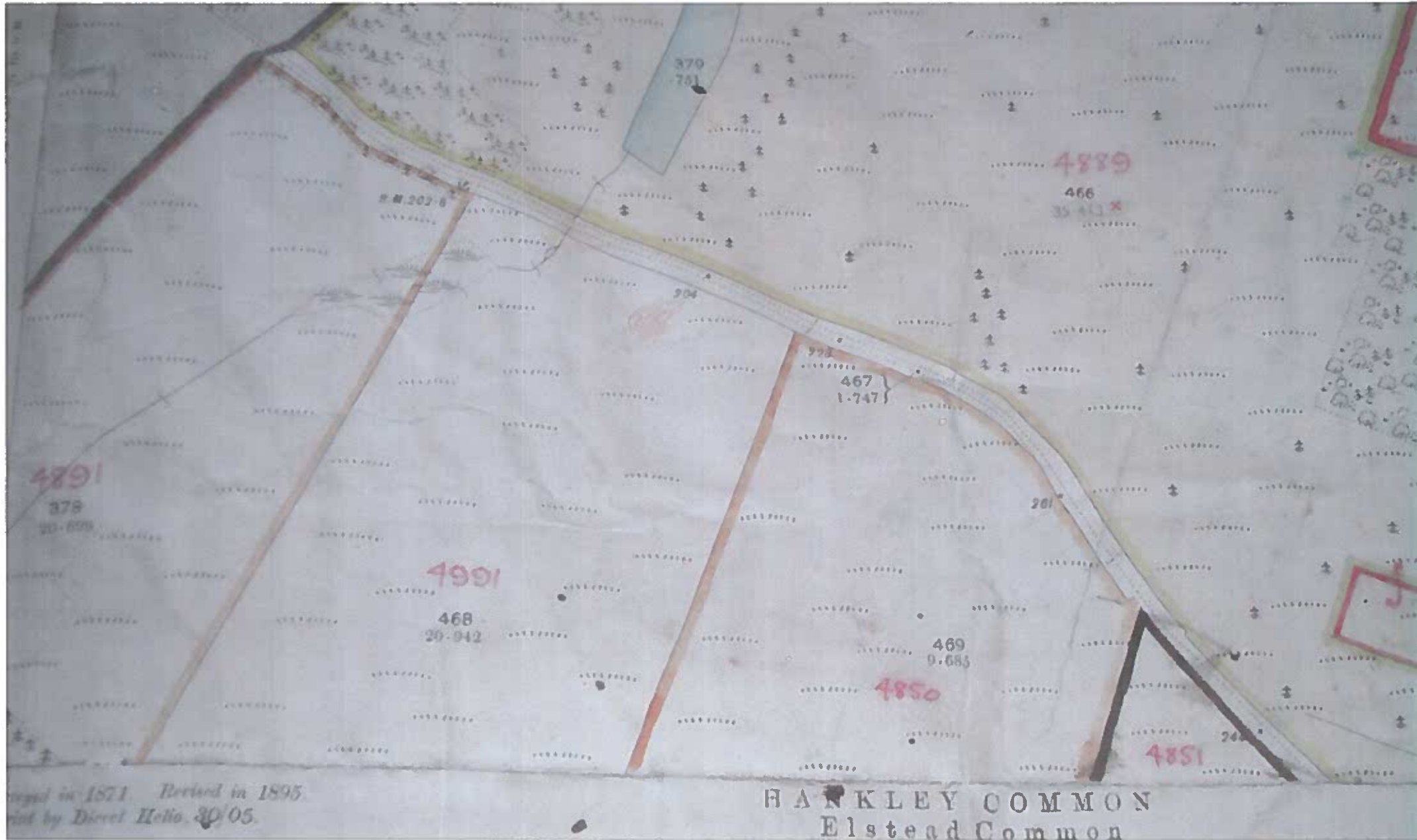
1812 Taxation map.jpg