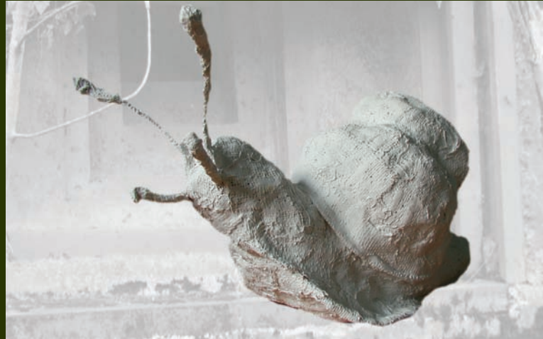
Snail Trail, Jono Retallick

Site: Snail Trail is situated in the pill boxes along the Moor Park Heritage Trail from Moor Park House to Waverley Abbey. This can be reached on foot from the Shepherd and Flock roundabout or the small parking area at the Abbey.