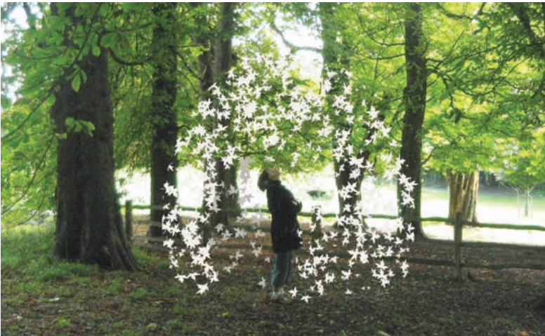
Folly, Ali Clarke

SUSPENDED BENEATH a cluster of mature trees floats a contemporary folly. Ali Clarke has created this sculpture working alongside Art Matters, a local community mental health project. It makes reference to those historic structures in the landscape created for simple purposes like looking at a view, watching clouds or simply contemplation. This draws the viewer into an area that would normally be passed by, then encloses them and draws focus to their individual experience.