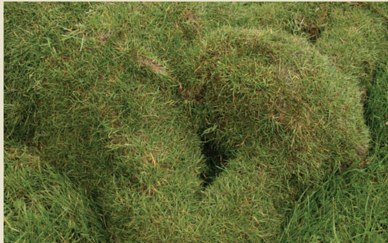
Merge, Sharon Baker

Site: Merge is located beside the North Downs Way opposite the Millennium Stones at Gatton. From the Wray Lane car park, cross the road and follow the 'Discover Gatton Walk'. This walk is steep and muddy in parts. For those with access difficulties, contact Gatton Park on 01737 649066 for access to parking adjacent to the site.