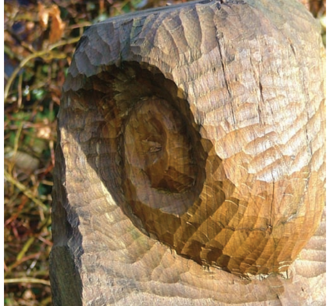
Painting with trees

Site: Winkworth Arboretum is 2 miles south of Godalming on the East side of the B2130 and has a car park. Buses 42 and 44 from Godalming station pass nearby. An alternative car park is available for those with access difficulties, please ask at the information booth.